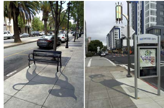
Damon Belanger-Redwood City