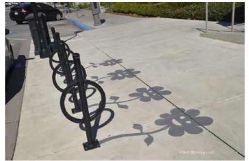
Artist - Damon Belanger - Redwood City

The work could include images, words, and messages that will engage the passerby and promote our city and community in a playful, fun and artistic way.