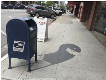
Damon Belanger-Redwood City